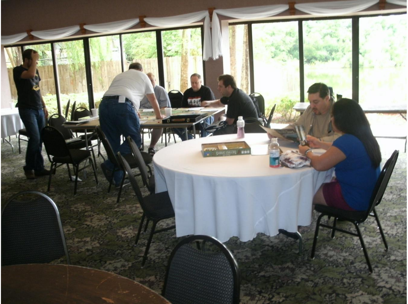
Playing By Daylight In The Breakfast Room

Of course, I have never fully understood how people could settle for cardboard tiddly winks when they could have genuine toy soldiers. But RAPIER 2012, for all its interesting miniatures games, impressed me with the number and quality of board gaming. There have always been board games, FRP, etc. at RAPIER. But while I've seen at least as impressive miniature offerings in the past, I don't think I've seen as much in the way of board games and the like.