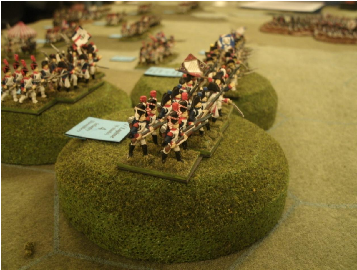
Again, Some Napoleonics-But None Over 15mm