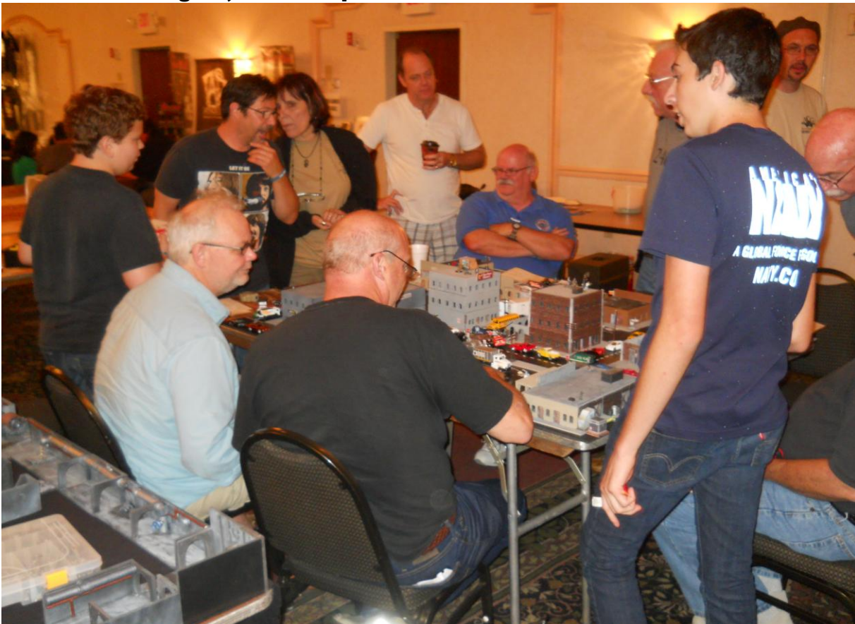
And As Usual Zombies Were Well Represented-Why I Don't Know