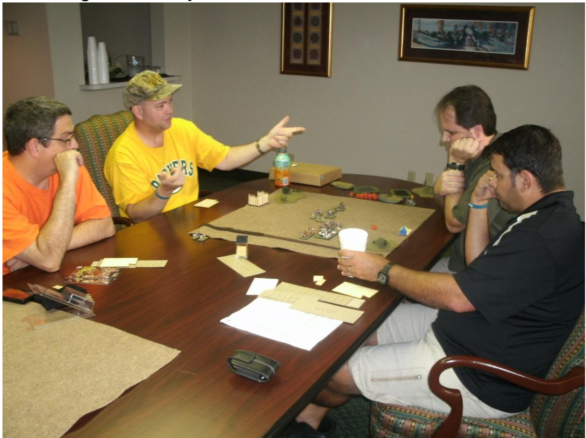
Upstairs DBA And SEEKRIEG