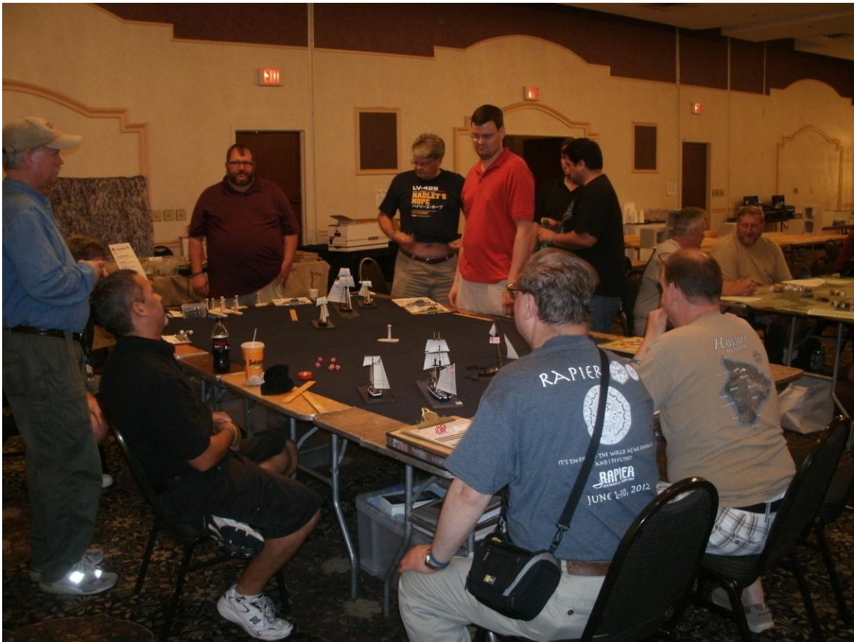
Raid on Sackett's Harbor-War of 1812 With Edgar Pabon's Big Boats