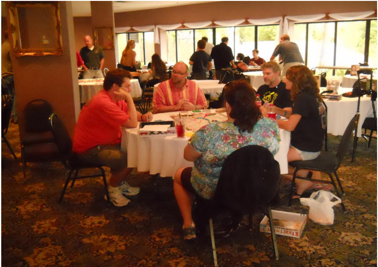
There Was Lively Board Game Action Throughout in the Breakfast Room