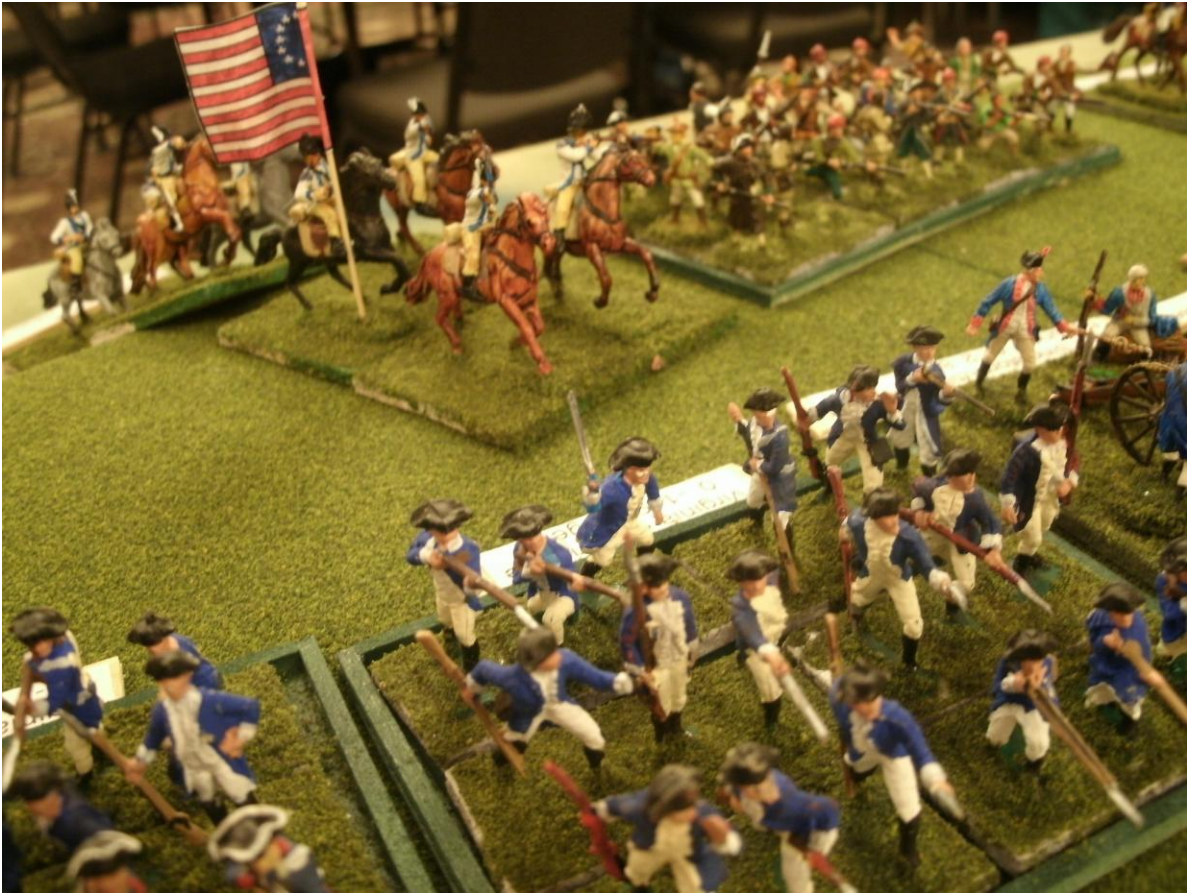
Hobkirk Hill From the AMR Was More Respectable, Though in 22mm Plastic not 15mm