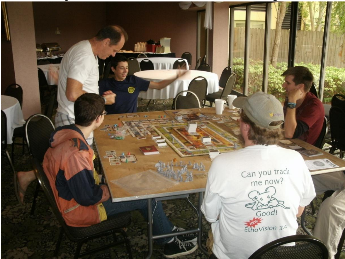
Sort of a Board Game-In Spite of the Unpainted Toys