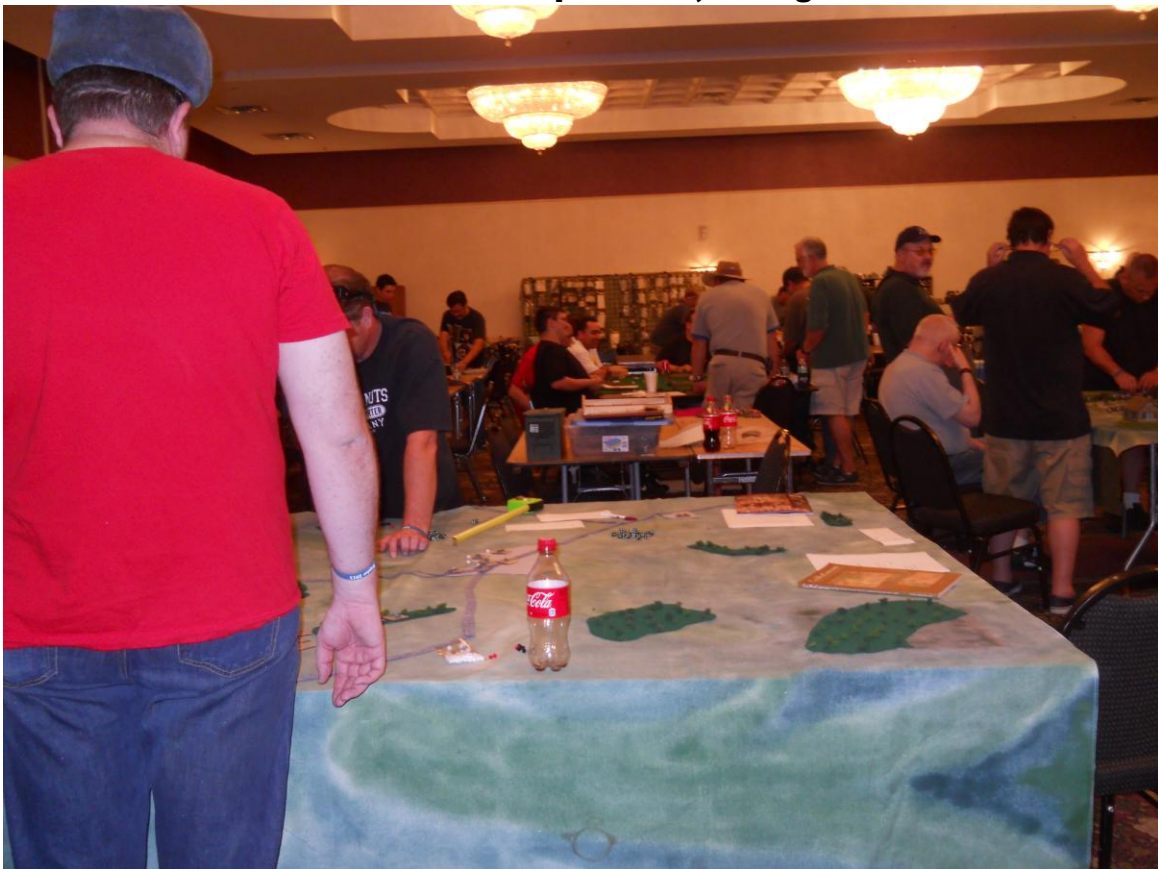
I Think This is WWII in 3mm-But I'm Not Sure Because the Toys Are Too Small