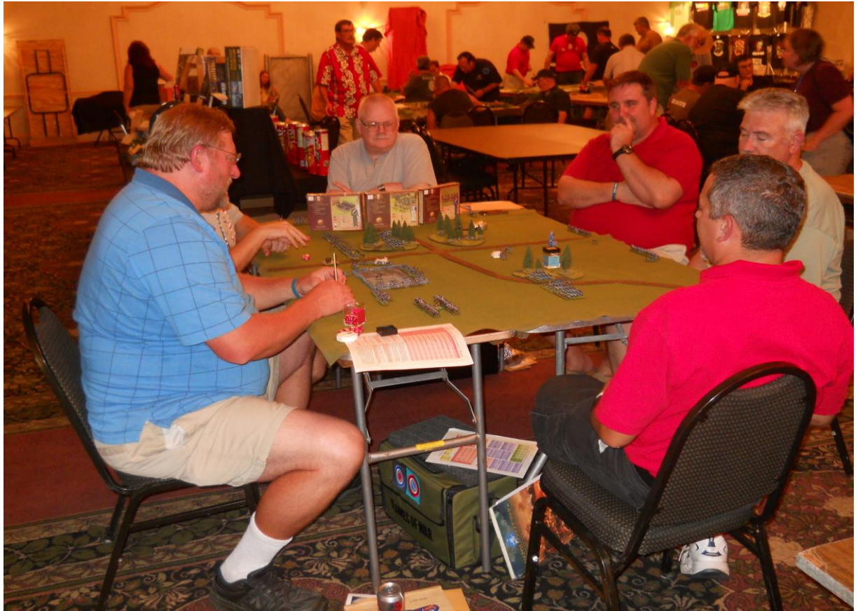
Although Lacking 25mm Column Line and Slaughter, Napoleonics Were Represented