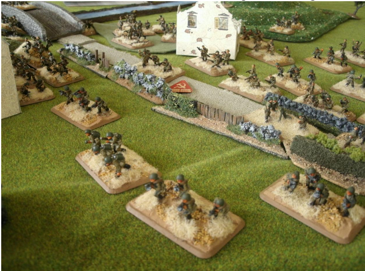
Missed The 40K-But Caught Part Of FOW In The Penthouse