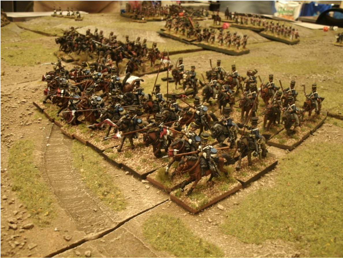
Tennyson's Gallant 600 With 17 th Lancers In Foreground